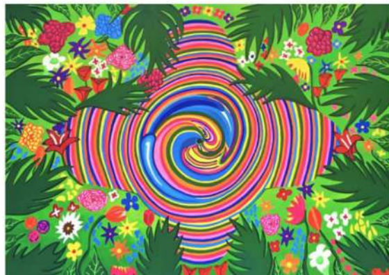
COLOR INVASION I

"Color Invasion I" is a painting (Acrylic on Canvas) that opens my last painting series, called "Color Invasion". This series is important to me, because it shows the colors as protagonists, showing their value in different contexts, having nature as a representation of the use of colors in an intense way. My culture and origin, coming from Brazil, have a huge influence on my work and this series, also because of nature, being colorful, fun, and ludic, also connected to imagination, creating different effects.