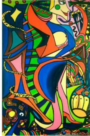
CONTINUOUS CONNECTIONS Acrylic on canvas - 120x80 cm

I graduated in Industrial Design and Fashion Design. And I also studied piano and other creative mediums. So, I believe that I like to have other studies and experiences in creative fields, to have a bigger reach and a bigger understanding of what I want and like as an artist.